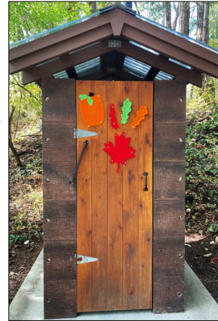
A decorated Outhouse.

your garden. I use garlic for perimeter planting around plants that might be considered delectable to deer and rabbits, as the garlic naturally repels them. It pairs well with beets, brassicas, lettuce, potatoes, celery, tomatoes, and strawberries. It works well and will flourish