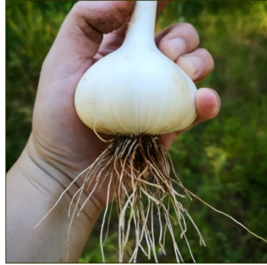
(Living Wild Garlic con't on page 18)

As if there were not enough benefits of garlic already, it is of great value while it grows as well, and it collaborates with companion planting in