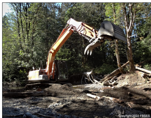
An excavator works in Cook Creek to clear a stream bed blocked with gravel and sediment for imminent spawning runs.

Our most recent outside job has just been completed in Cook Creek where a successful 2007 project had built six weirs - pools with downstream rock borders to improve fish habitat. Recently, vast amounts of gravel from the higher slopes had filled the center of the stream. High water flows had overrun banks and diverted