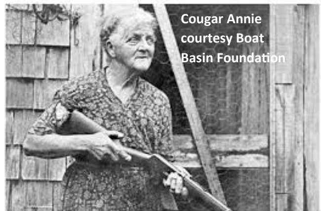
Turn to page five, 'Living Wild' for article on Cougar Annie