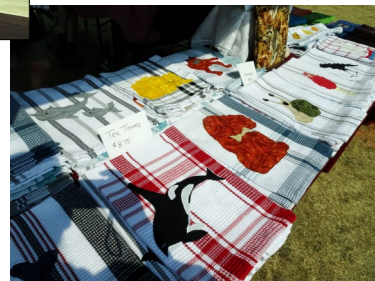
Appliqued Tea-Towels & Tea Cozies by K.D. Crafts