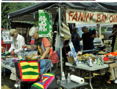
Our own Fanny Bay Quilters... always a favorite stop at the Christmas Craft Sale