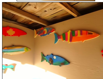
TOZER ROAD BUS SHELTER BOOK EXCHANGE & ART GALLERY