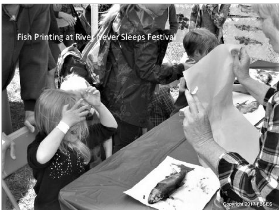
Fish Printing at River Never Sleeps Festival

Unique things like fish printing happen at the River Never sleeps Festival. You get a fish print by bringing a little person to the tent where nice