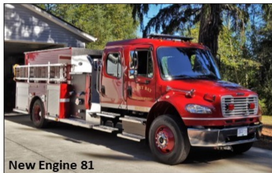
New Engine 81

Fanny Bay Fire department was please to take delivery of a new pumper at the end of August. The truck was built by Fort Garry Fire Trucks in Winnipeg. A long and involved process to develop a wish list of requirements was completed by the