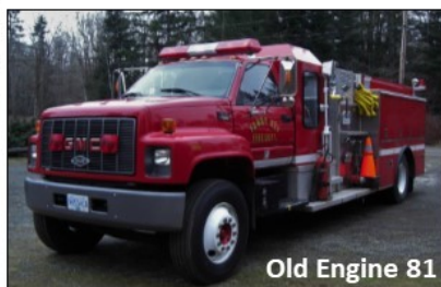
Old Engine 81