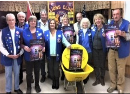
The Baynes Sound Lions are ready to Walk & Roll down the Highway to the 42nd annual Comox Valley Child Development Wheel - barrow Push.

Or Raffle cut off date is Nov 4th , with draw on Nov 5th at the Highwayman Pub after the Wheel-barrow Push walkers arrive. Tickets are $2 ea or 3 for $5. All proceeds to the Wheel-barrow Push for the Kids at the Comox Valley Child Development Centre. Winner will be announced in the December Fanny Bay Flyer.