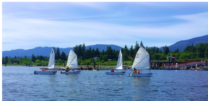
STUDENTS SAILING IN JULY (ABOVE) FIELD TRIP FOR SCIENCE PROGRAM (BELOW)