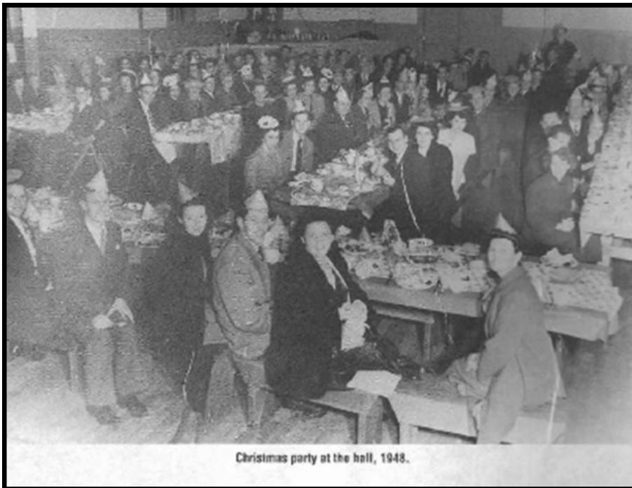
Christmas party at the hall, 1948.